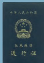
紙本 Booklet version

Applicant should enter or depart Hong Kong by the "Exit-entry Permit for Travelling to and from Hong Kong and Macau (EEP)".