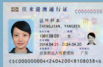
電子卡式 Electronic version

請攜同簽證標籤辦理入境手續 Bring visa label together with EEP